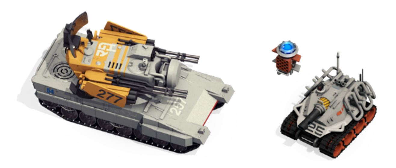
New: Compatible with Synthetik Arena & Combines with the Arena Supporter Pack for a upgraded Icon and Color!